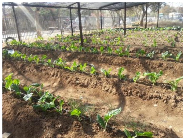
Raised beds with drip irrigation